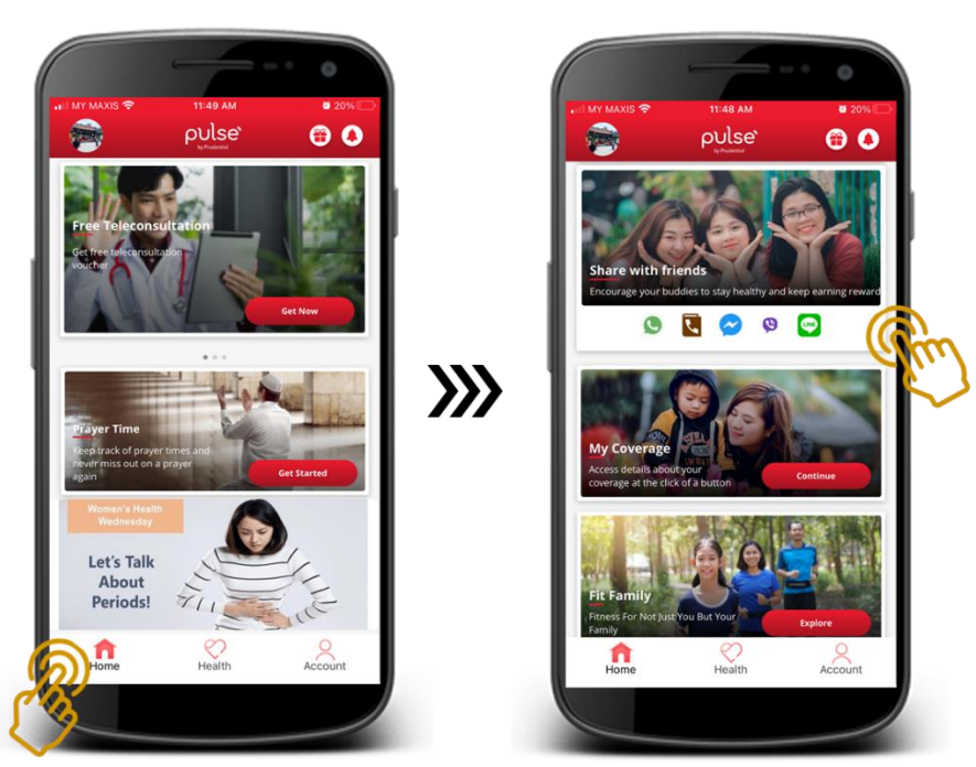
Tap on "Home" Tab and scroll down to look for "Share with friends" tile

Use the 'Share with friends' function on "Home" tab to share the app with your friends and family.